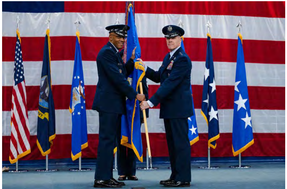
Gen. Thomas Bussière, Air Force Global Strike Command commander, receives the guidon from Air Force Chief of Staff Gen. CQ Brown, Jr. during the AFGSC assumption of command at Barksdale Air Force Base, La., Dec. 7, 2022. The passing of the unit's guidon symbolizes the official transfer of command to Bussière.

Bussière assumed command from Gen. Anthony Cotton, who is scheduled to take command of U.S. Strategic Command Dec. 9.