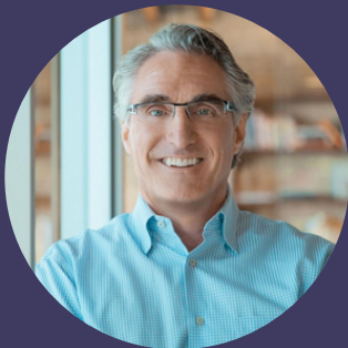
Gov. Doug Burgum Featured Keynote Speaker